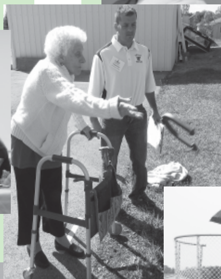
The Senior Olympics was filled with friendly competition.