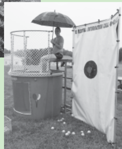
Despite the rain, everyone had buckets of fun at the Family Fun Fest