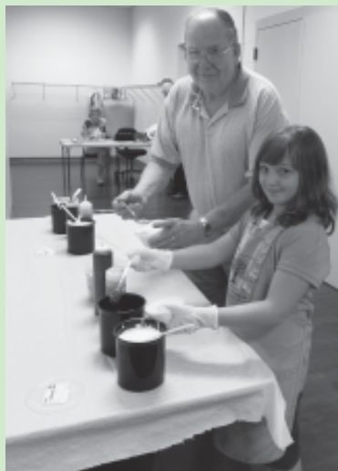
The annual Ice Cream Social was fun for all ages.