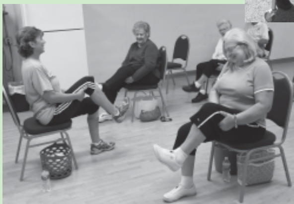
SilverSneakers® participants kicked-up their heels at The Fitness Center's first anniversary Open House