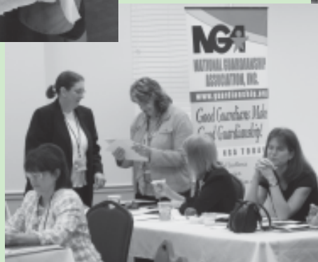
The Ohio Guardianship Association's conference drew from across the state.